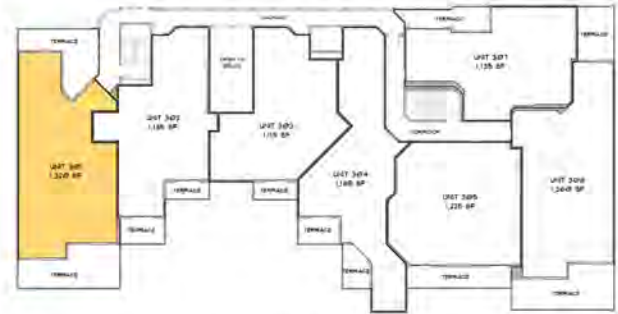
FIFTH AVENUE SOUTH