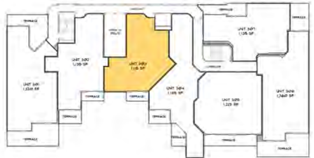
FIFTH AVENUE SOUTH