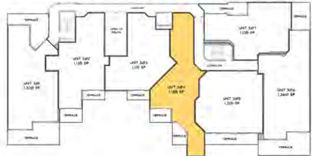
FIFTH AVENUE SOUTH