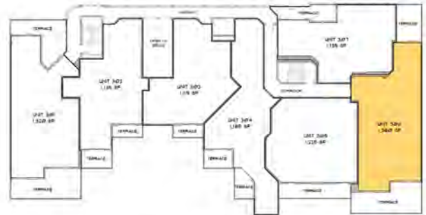
FIFTH AVENUE SOUTH