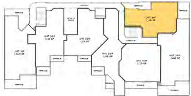
FIFTH AVENUE SOUTH

Living Space under air: 1,135 sf Terrace 130 sf Total Area 1,265 sf two bedrooms two bathrooms